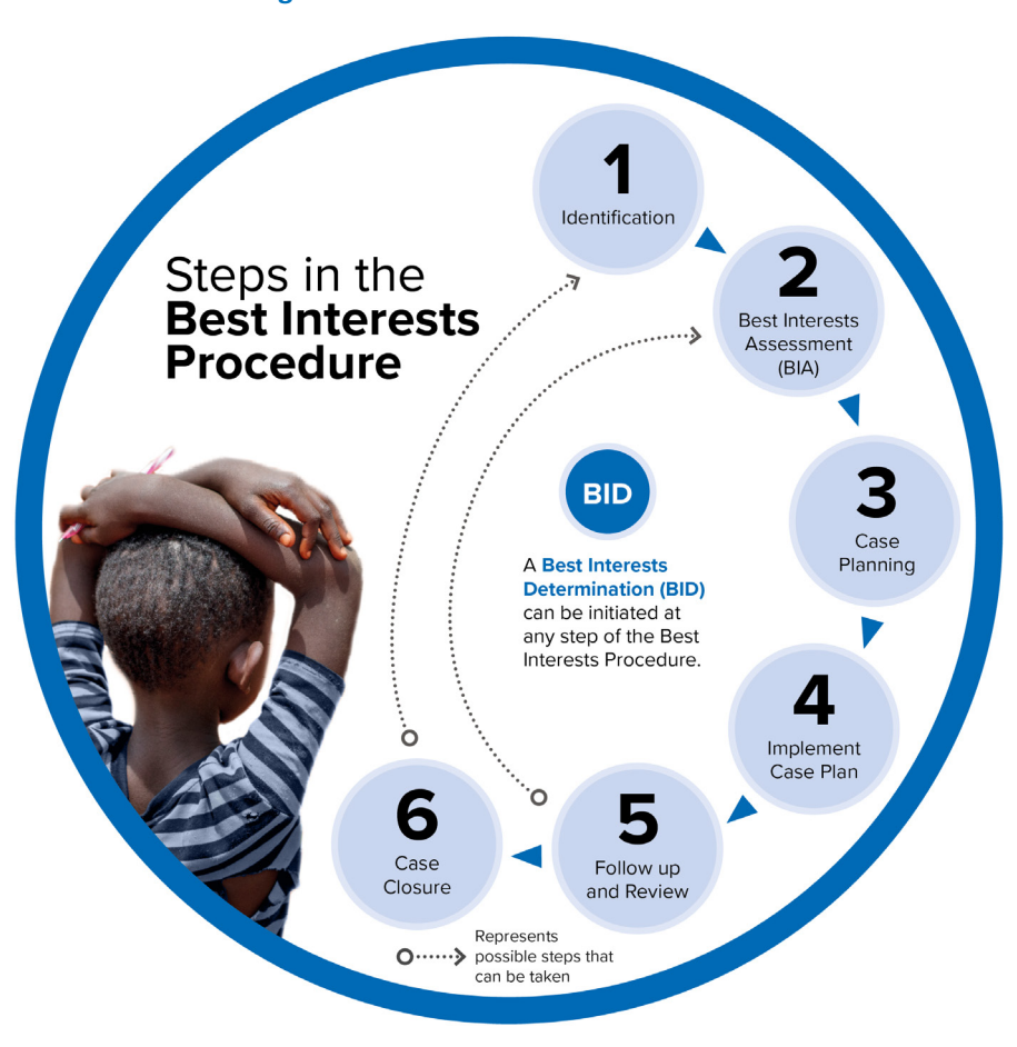
Figure D: Child Best Interests Procedure<sup>54</sup>