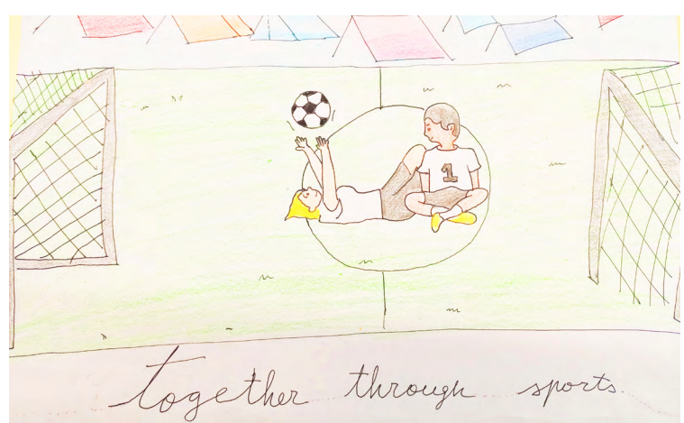
Shiming, 13, Spain

"I drew people from many countries huddling together. This means that sports bring everyone together."